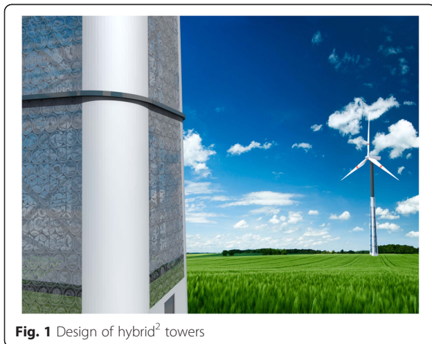
Fig. 1 Design of hybrid 2 towers

The structure of new wind turbines continues to develop in the direction of prefabrication of individual